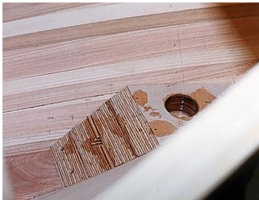
Mast step with drainage hole