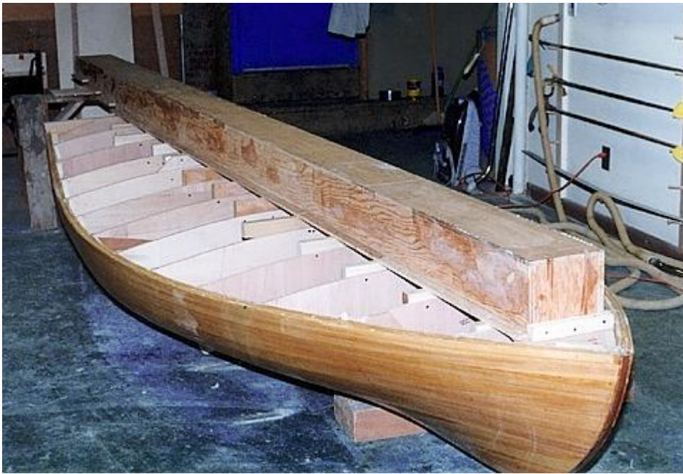
Outside of hull now finished with 3 coats of epoxy; turned over and lowered off the saw horses to begin removing the box beam. Note cleats used to align the station molds and to keep them vertical.